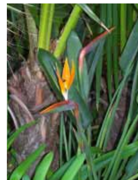
Bird of Paradise is found in many warm locations~Mexico, Southern California, Hawaii

Brussels England Berkeley, California Yosemite, California Atlanta, Georgia