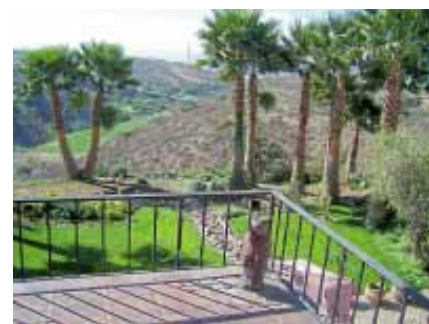
A view from an American owned Casita near Rosarita Beach, Mexico